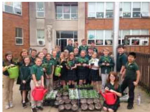
(Top and Right) The 3rd and 4th grade classes with their portable gardens.

The Highmark Foundation recognizes that schools are powerful place to shape the health, education and well-being of our children. This grant helps St. Paul School to create a healthier school environment resulting in positive behaviors for our students that will last a lifetime.