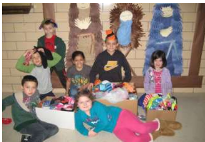
(Left) Students with the socks collected for Children’s Hospital

A Silly Sock Day was held at the end of the year where the students had a Free Dress Day and wore silly socks. The students were also asked to bring in a pair of socks to donate to Kelsey’s Christmas. The donation totaled over 200 pairs of socks! These socks went to patients admitted at Children’s Hospital of Pittsburgh of UPMC.