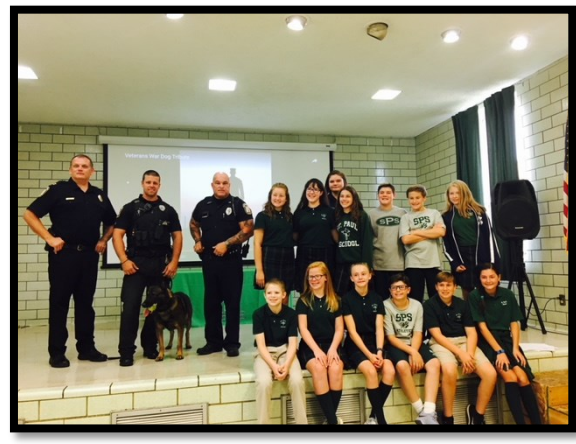
(Above) 9/11 Program