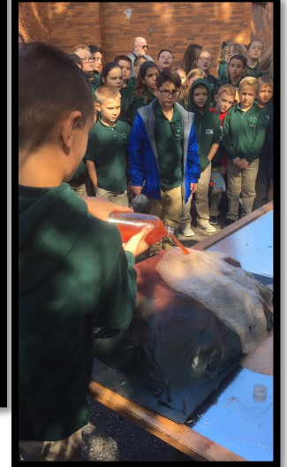
(Left) 4th Grade Volcano Project