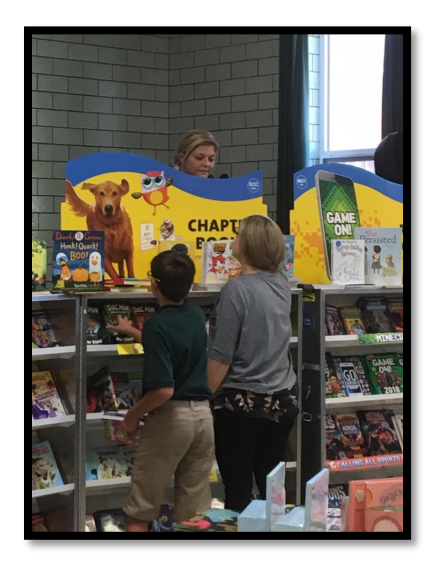
(Below) Fall Book Fair