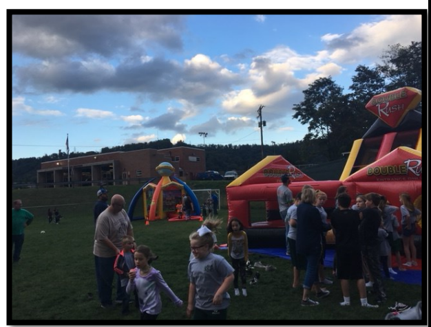
(Below) Splash, Dash, and Bash