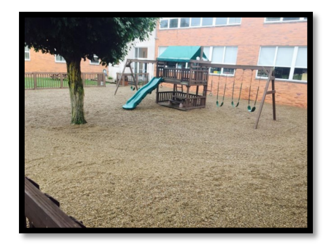
(Above) The playground space before and after.