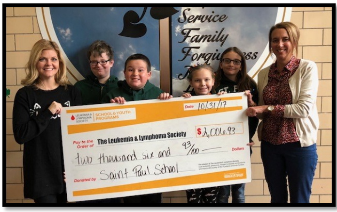
(Above) Over $2,000 was collected for the Leukemia and Lymphoma Society through Pennies for Pasta. Fifth Grade won a pasta lunch from Olive Garden.